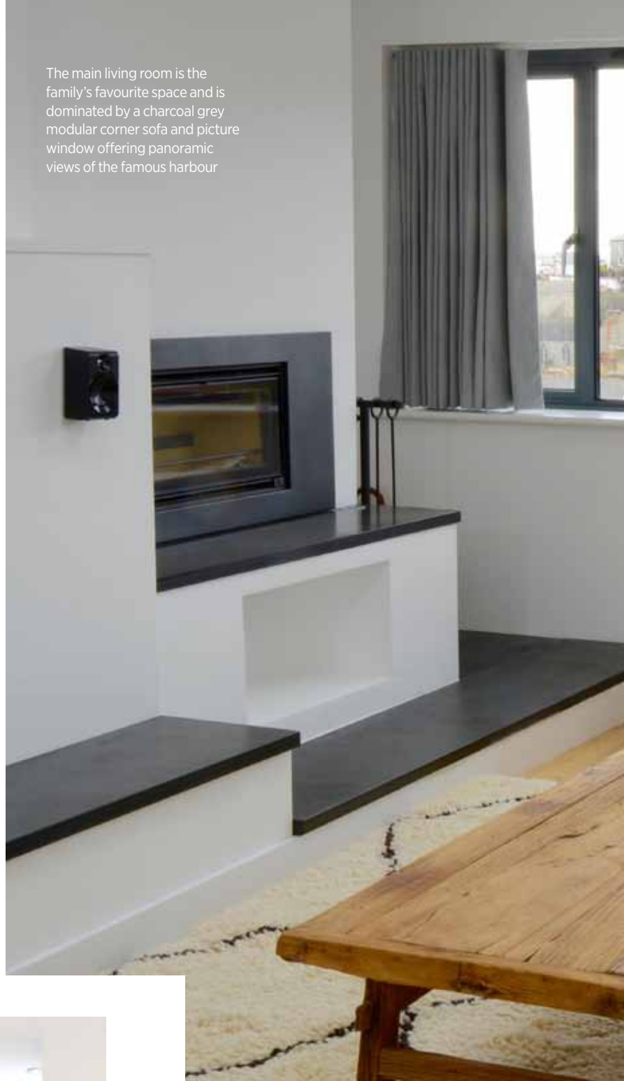
The main living room is the family's favourite space and is dominated by a charcoal grey modular corner sofa and picture window offering panoramic views of the famous harbour