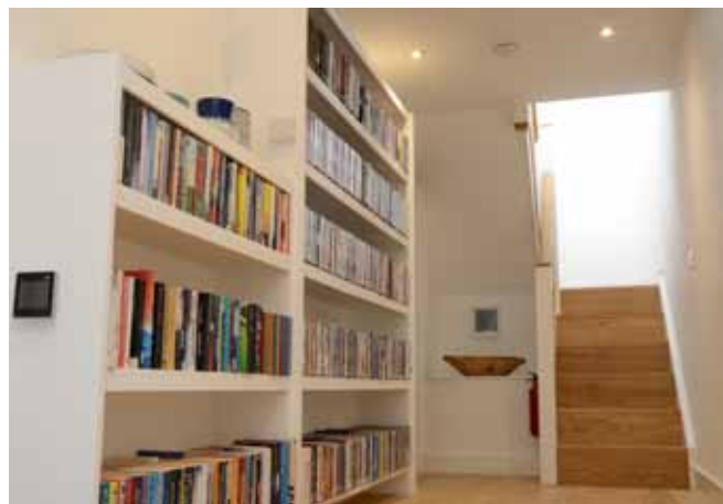
The first floor is the largest and features three bedrooms, a family bathroom and living area as well as space for books.