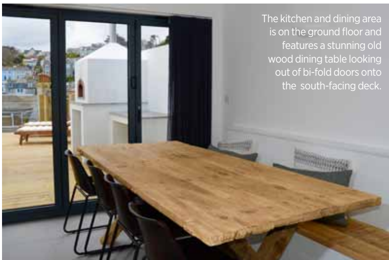
The kitchen and dining area is on the ground floor and features a stunning old wood dining table looking out of bi-fold doors onto the south-facing deck.