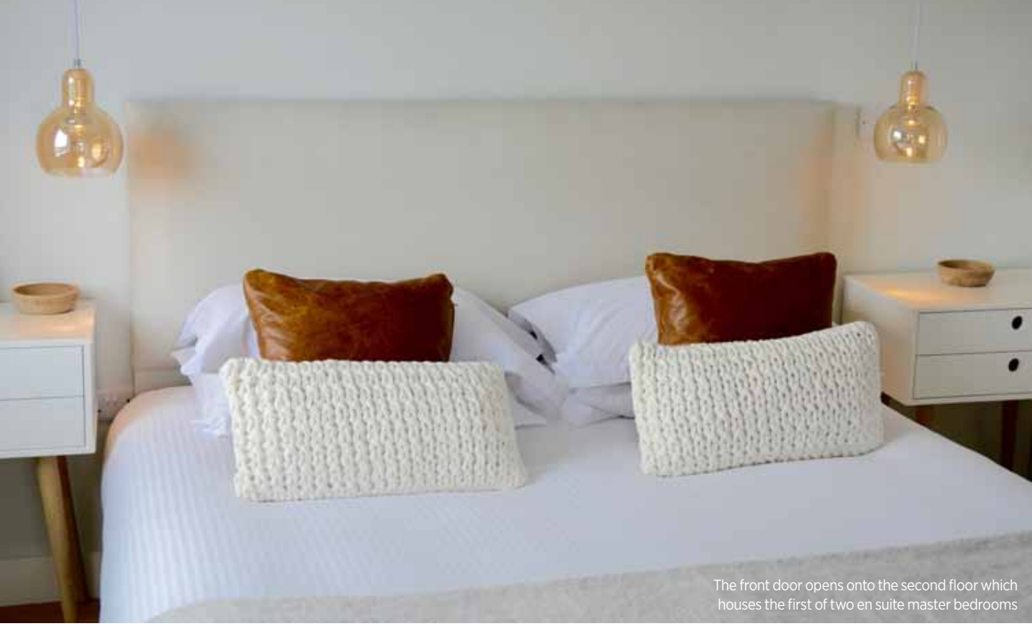
The front door opens onto the second floor which houses the first of two en suite master bedrooms

took shape during construction we wanted to keep an open plan feel and we're really pleased we did that,' says Stuart. 'The lounge has the height and brightness of an art gallery with amazing windows and a fabulous view while at the same time having the potential, on winter nights, to be cosy with surround sound home cinema, wood-burning stove and snuggly sofas. Quirky reclaimed timber tables and stylish pendant lights add a golden glow to a fabulous space. We really love it.'