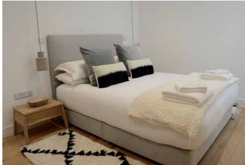
above The second master bedroom sits on the first floor and has a partial double height ceiling to let in natural light from the floor above.

The first floor features the second master bedroom and two further bedrooms all making clever use of the natural light with Velux windows. The master bedroom here has a partial double height ceiling giving access to a roof light and taking advantage of the natural light from the frosted glass window on the light-filled upper floor. Each room has touchpad controls for the Velux windows allowing you to control their opening and internal blinds from any room. There are walk-in showers in the en suite bathrooms while